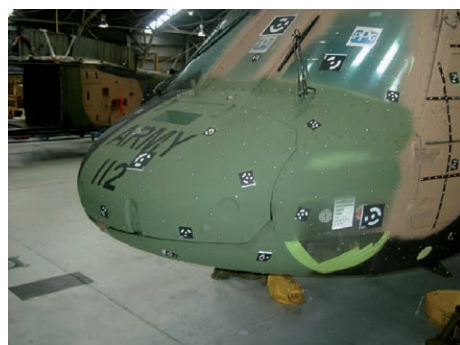
Fig. 5: Nose - prepared for scanning with ATOS

After the TRITOP stage had been completed, the ATOS 3D scanning stage was started. A typical area which had to be scanned, the nose section, is shown in Figure 5.