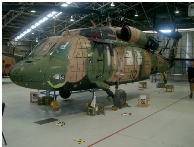
Fig. 3: Fuselage prepared for scanning

In total, 41 scan data files were created covering both external and internal areas of the aircraft. These contained 12 million data points while maintaining an accuracy of 0.1 mm overall.