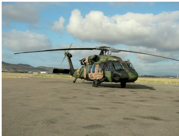
Fig. 1: Black Hawk Helicopter from the Australian Army, Fuselage Size: 15.4 x 2.4 x 2.3 meter (Length, Width and Height)

BAE Systems Australia contracted MOSS / Scan-Xpress to undertake 3D Photogrammetry and 3D Scanning of the aircraft. Both external and internal data was required.