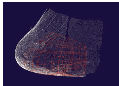
Fig. 6: Nose - ATOS Scan data (optical white light scanner data)