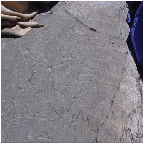
3D laser scanning of engraved tablets helps archeologists learn more from eroded artifacts.